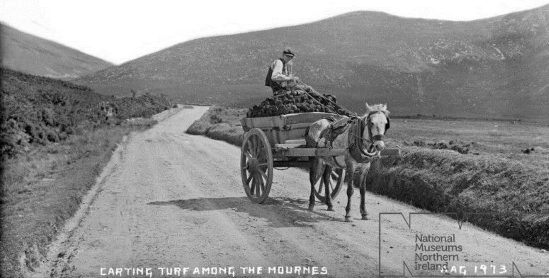
CARTING TURF AMONG THE MOURNES